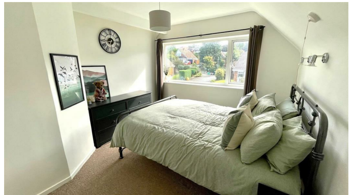
BEDROOM 2 11'5" x 10'0" maximum (3.50m x 3.06m maximum)

Fully tiled corner shower cubicle, vanity wash hand basin, low flush w.c., downlighters, extractor fan.