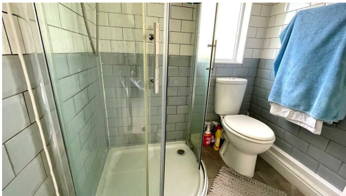
MODERN SHOWER EN-SUITE

Fully tiled corner shower cubicle, vanity wash hand basin, low flush w.c., downlighters, extractor fan.