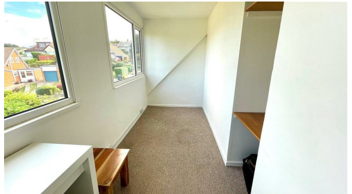
BEDROOM 3 (currently used as a Study) 14'7" x 4'11" approximately (4.46m x 1.51m approximately)

Small storage cupboard, alcove with shelving, radiator.